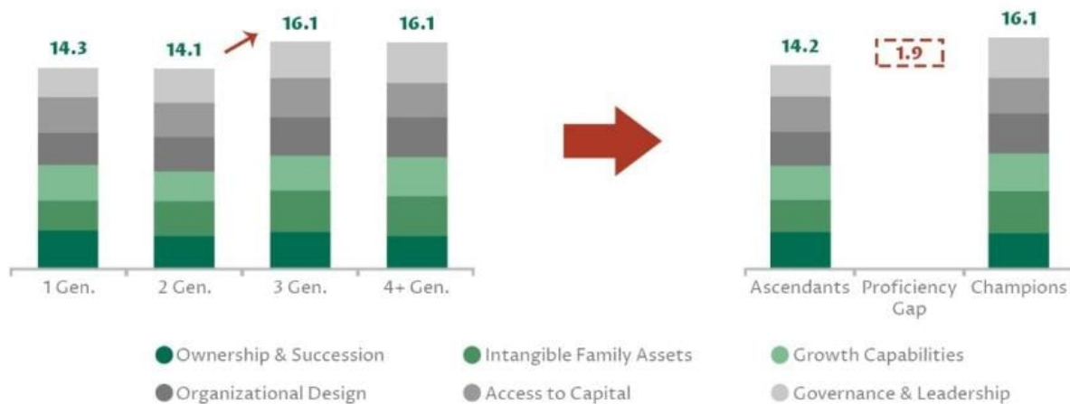
Exhibit 1: level of institutionalisation by generation - Europe

Across the six attributes, Champions scored much higher than Ascendants (echoing similar results in the past two reports). But the proficiency gap could not be ascribed equally to all six. Intangible family assets – encompassing a family firm’s unique heritage, values and stakeholder