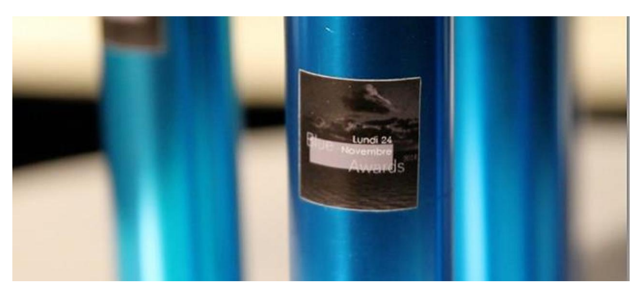
By An INSEAD Blue Ocean Strategy Institute (IBOSI) Report