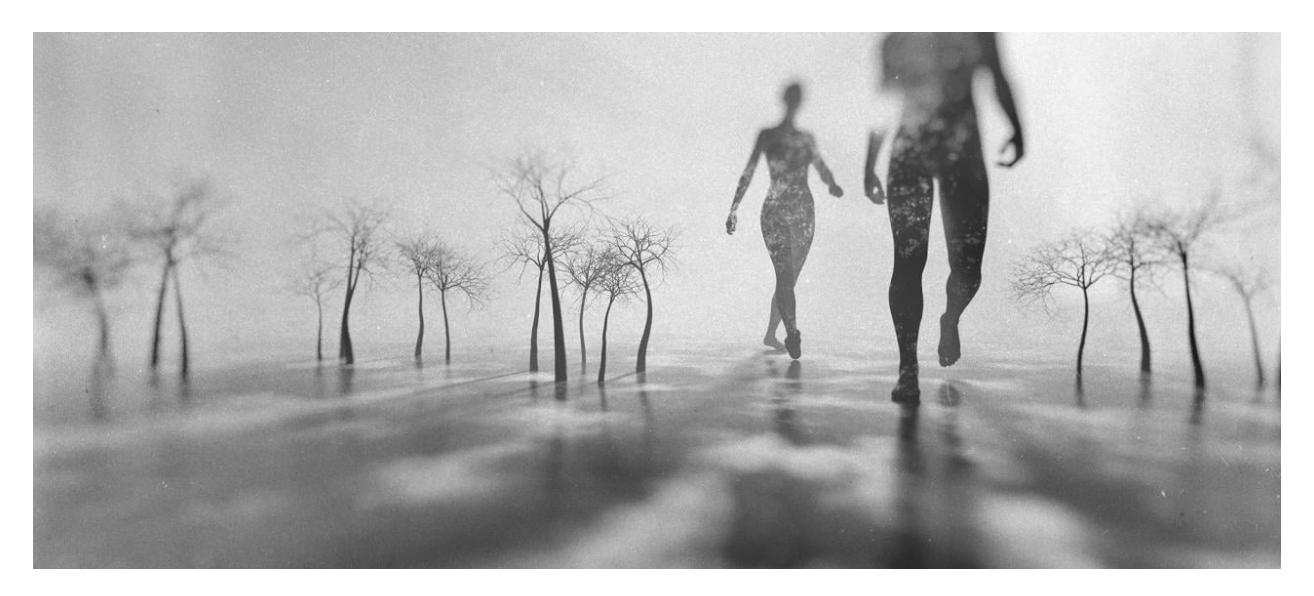
By INSEAD Knowledge